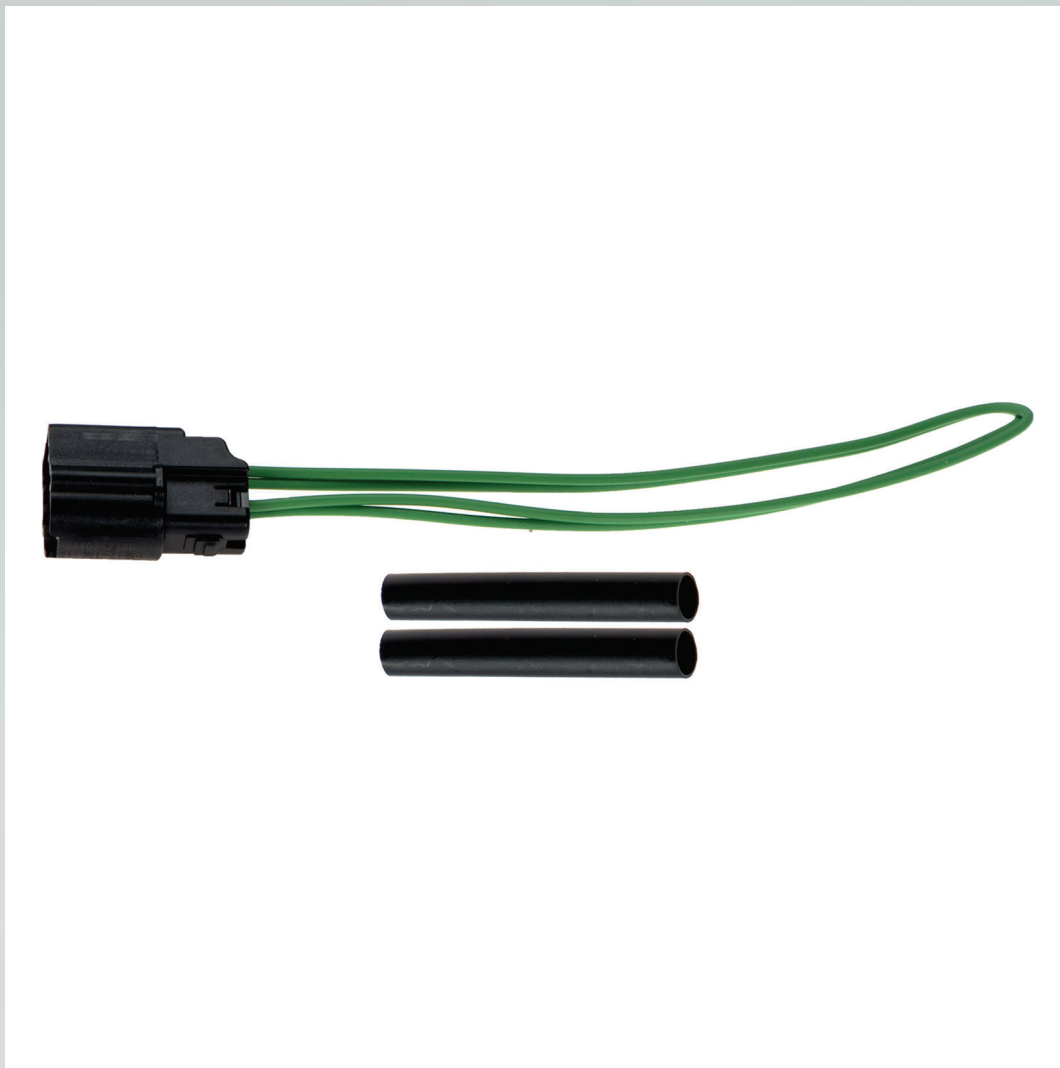
Ford PN # 8U2Z-14S411-AAC (Not Included)